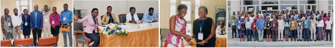
2019: GMet Team meets CCPOP-Ghana Convener (middle), GMet on a Panel, Presentations and some Side Event Participants in a Group Photo.