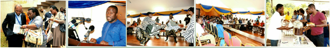
2018: Accra's Mayor, Hon. Adjei Sowah delivers a Keynote Address, amidst activities of dance and fun.