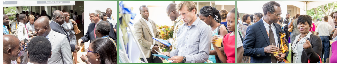
2015: Head of the EU in Ghana, VC, University of Ghana, Ghana's Environment Minister & Scientists network following the Official Opening.